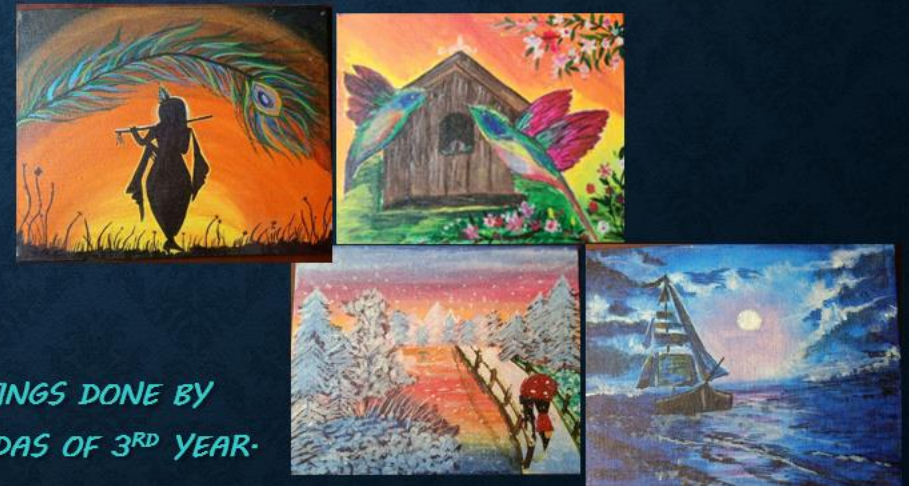
PAINTINGS DONE BY RIYA DAS OF 3 RD YEAR.