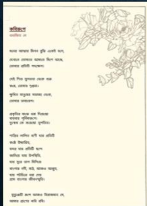
Poetry done by Subhajit Dey of 2 nd year