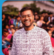
ARGHYA MONDAL AUTOMOBILE 2024 QH TALBROS